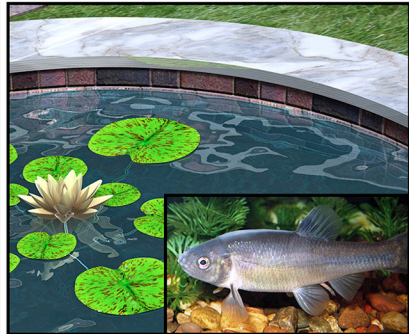
Keep Fathead minnows or Rosy-reds in ornamental ponds