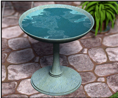
Clean bird baths once a week