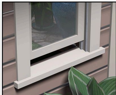
Use window screens and repair holes