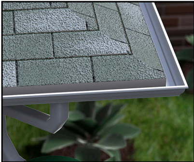
Keep gutters flowing and clean of debris