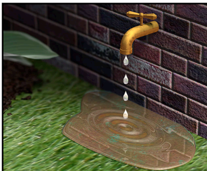
Repair leaking watering equipment