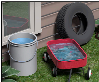
Store anything that holds water for more than a few days and drill drain holes in tire swings