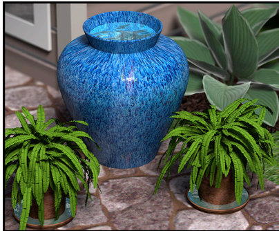
Keep ornamental pots and plant saucers free of standing water