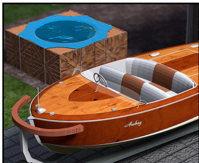
Cover open boats; eliminate any water collecting in tarp depressions