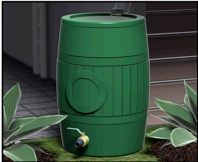
Seal or screen all rain barrel openings and treat with mosquito dunks monthly